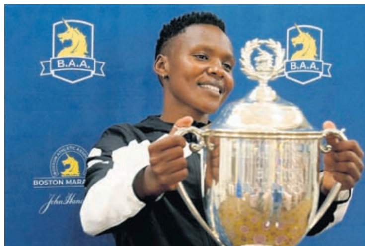
Diana Kipyokei, of Kenya, holds a Boston Marathon championship trophy following a news conference, on Oct. 12, 2021, in Boston.